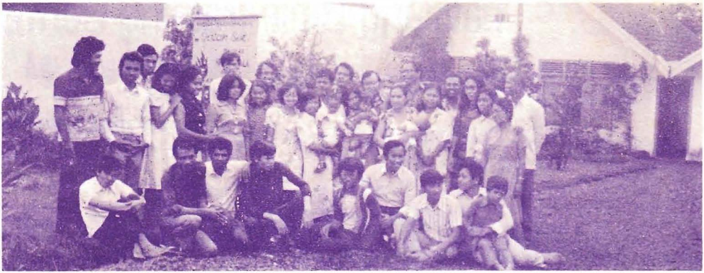
1978 Students, Staf families of LBTC, some members of Boat ministry and guest in the small front garden.