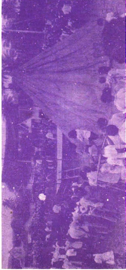
Hundreds, even thousands came to hear the Good News of the Gospel of Jesus Christ. Behind the podium, is a parachute converted into a room of prayer.