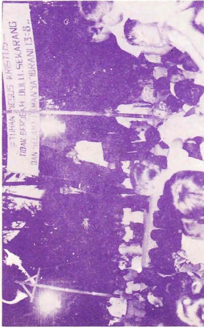
Darto delivering the message and the Truth of the Lord Jesus Christ at an evangelistic and healing campaign in Center Java 1976.