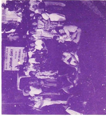
LBTC "big family" in the front garden.