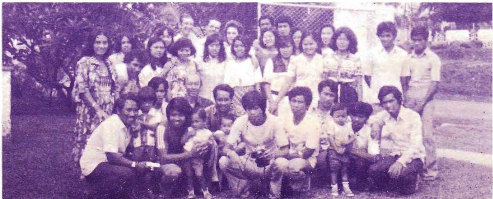
1980 The LBTC "big" Family with some guests.