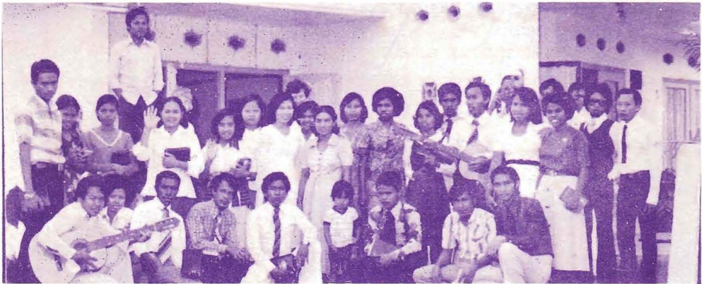
1979. LBTC students and some guests.