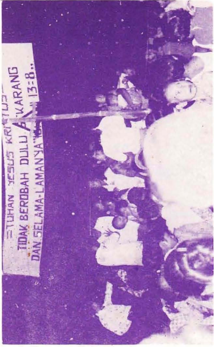
After the Word and message was delivered they came up on the stage; some to be prayed for healing, some for deliverance and all to be followed up.